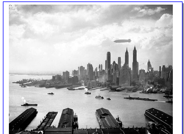
The German zeppelin Hindenburg floats over Manhattan Island in New York City on May 6, 1937.