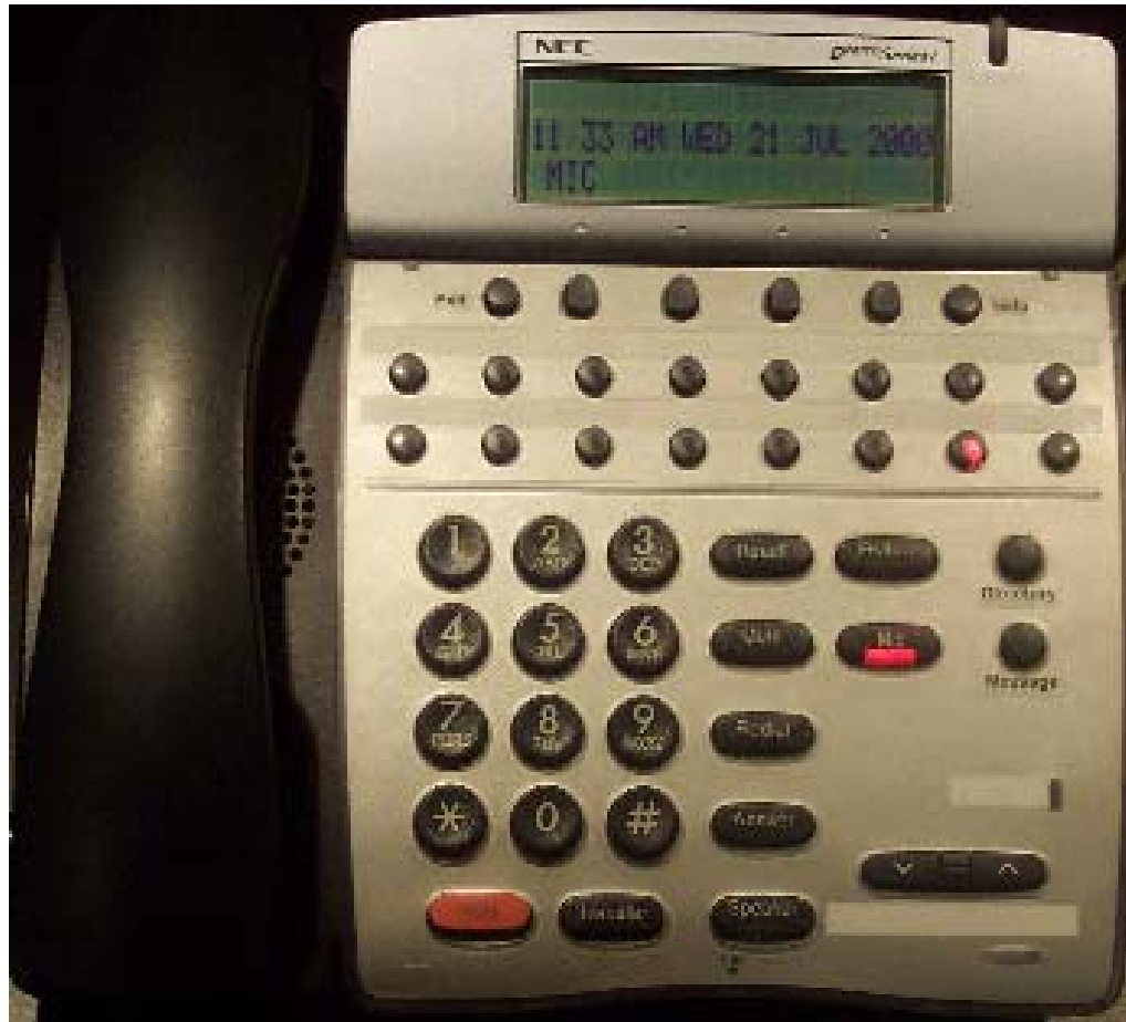
16 Button Display Phone